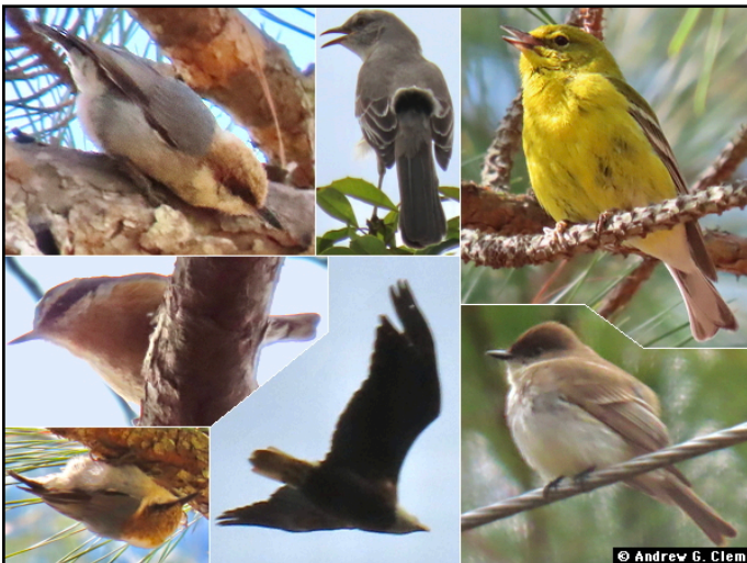
CLOCKWISE FROM TOP LEFT: Brown-headed Nuthatch, Northern Mockingbird, Pine Warbler (M), Eastern Phoebe, Bald Eagle, Brown-headed Nuthatch, and Red-breasted Nuthatch. In the Piney Grove forest near Wakefield and Waverly, Virginia on March 18.