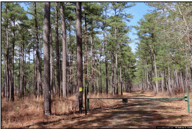
More Pine Warblers were seen near this gate in the forest.