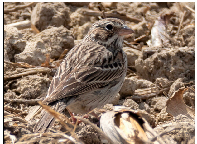
Vesper Sparrow at Cowbane Prairie on March 30.