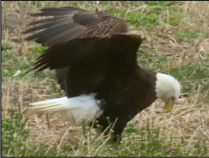
Resident Bald Eagle near Barrenridge Road gathering soft nesting material on March 30. An eaglet has been spotted in the nest by Bill Benish.