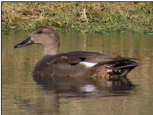
Gadwall (F) at McCormick's Mill on March 15.

On Saturday, March 18, five early-rising birders went on an expedition to the mysterious pine forests near Waverly and Wakefield, Virginia, in search of the fabled Red-cockaded Woodpecker. Allen Lerner was our guide. We saw many, many birds that day, but at least 95% of them were one of just two species: Brown-headed Nuthatches and Pine Warblers. As we got started birding in the Piney Grove area (shortly before 9:00 AM), it was overcast, damp, and chilly, with lingering drizzle. After lunch the sun came out, and the temperature rose a little. We saw a few Red-breasted Nuthatches, Pileated Woodpeckers, Northern Flickers, and Eastern Phoebes as well as a Red-shouldered Hawk and a Bald Eagle up above. We also heard a few Eastern Towhees and a White-breasted Nuthatch in those pine forests.