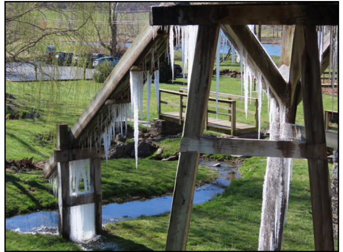
Icicles on McCormick's Mill, during the March 15 field trip.