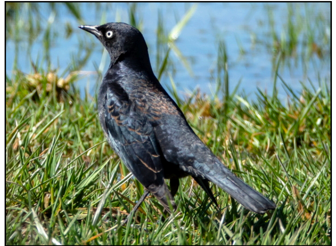
Rusty Blackbird, at Augusta Springs on March 5.