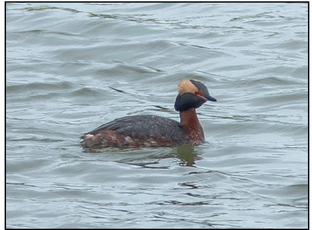
Horned Grebe at Hardees pond in Verona on March 25.