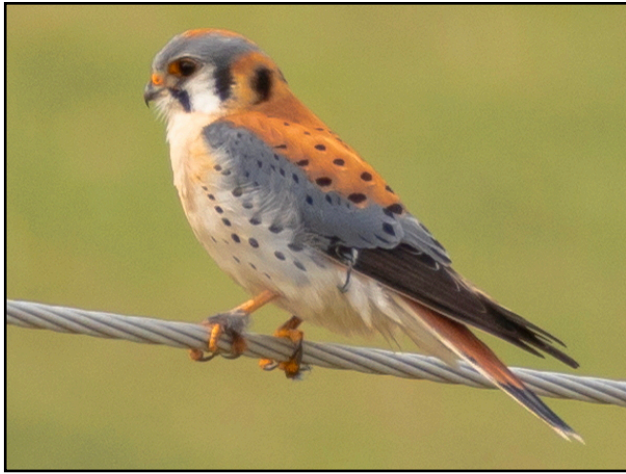
American Kestrel (M) in Swoope, March 25.