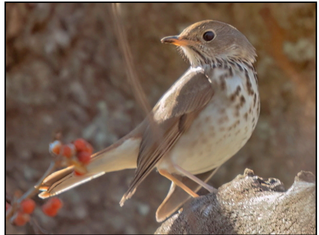
Hermit Thrush, in Jollivue, March 20.