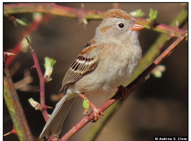
Field Sparrow, along the Mill Place trail, March 28

7) Repeated violations of the above rules may result in removal from this group.