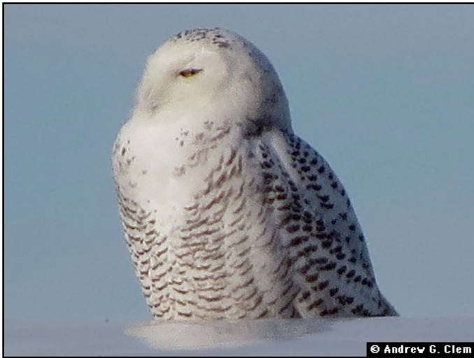
Snowy Owl, seen at a farm west of Mount Crawford, January 2. It is the same general area where this species has been seen in recent years.