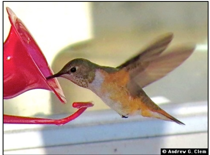
Rufous Hummingbird on Morris Mill Rd. north of Swoope, December 22.