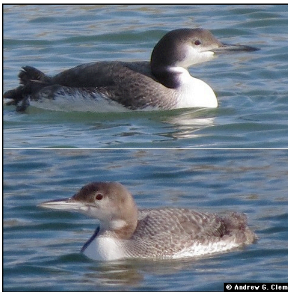
Common Loons (adult on top, juvenile below) on the pond behind Hardee's in Verona, December 30.