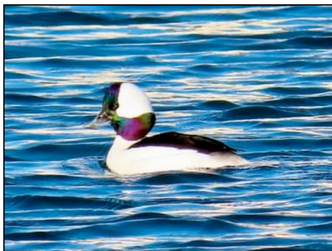
Bufflehead (male) on the Chesapeake Bay near Reedville, December 13.