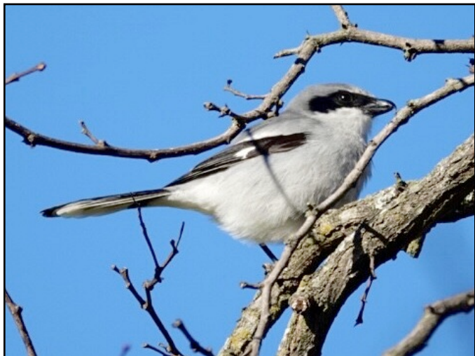
Loggerhead Shrike in Swoope, December 8.

NOTE: Field trips are subject to social distancing! The annual winter trip to Highland County will not be held this year due to the coronavirus. Check our website ( www.augustabirdclub.org ) for updates on field trips that have been cancelled or postponed.