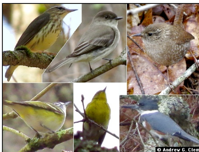
CLOCKWISE FROM TOP LEFT: Louisiana Waterthrush*, Eastern Phoebe, Winter Wren, Belted Kingfisher, Pine Warbler, and Blue-headed Vireo. *Chimney Hollow; the rest at Braley Pond (March 28.)