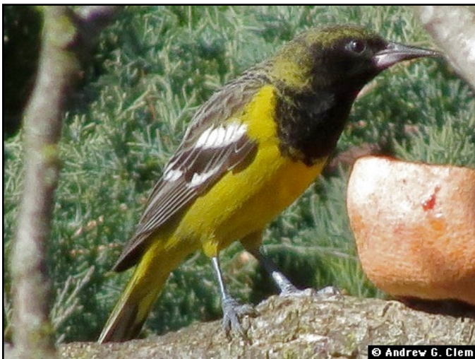
Scott's Oriole (first-year male), in Swoope on March 1.