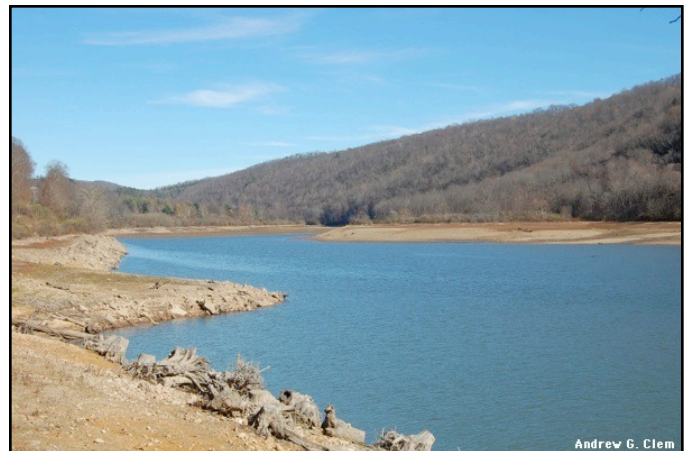
Lake Moomaw, in Bath County, November 2009.

We will be looking for eagles and other raptors, as well as mergansers, loons, or even cormorants. Unusual birds are often seen in this wilderness area, located in Bath County. Time permitting, we may stop at Augusta Springs or some other "hot spot" on the way back to Staunton. The field trip may be canceled in case of very cold or wet weather.