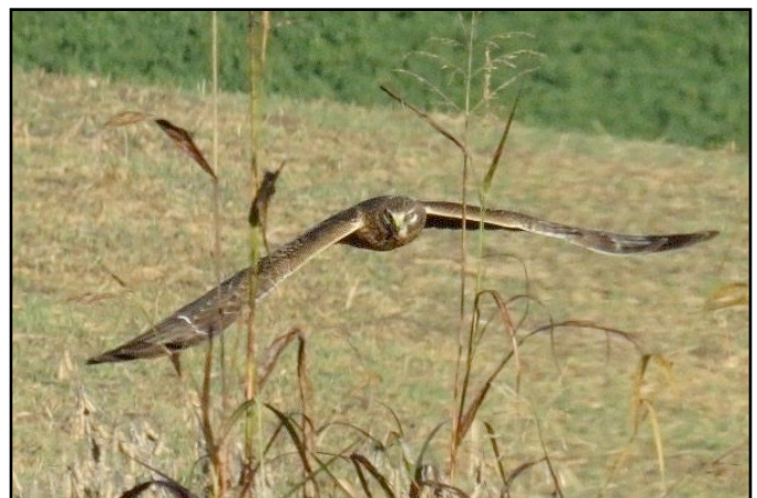
Northern Harrier, near Verona, in early November.

Several times since early November, Northern Harriers have been seen along Bell's Lane, as well as in parts of Augusta County. Sometimes they come swooping right at you, so watch out!