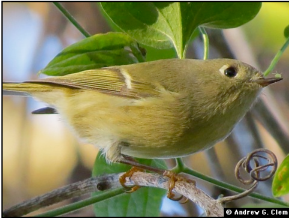
Ruby-crowned Kinglet, with an aphid in its beak. Staunton, November 4.