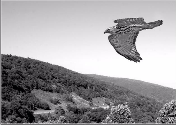
Rockfish Gap Hawk Watch Est. 1976