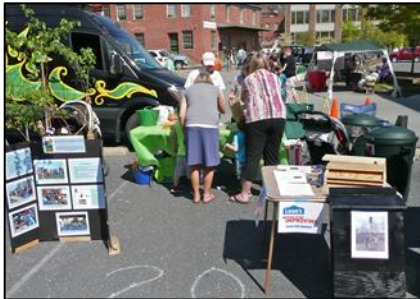
ABC exhibit and pinecone bird feeder activity