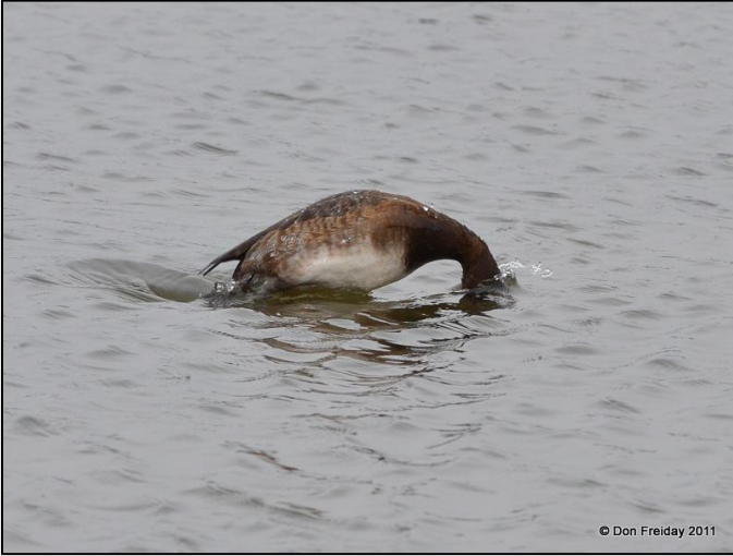
Last Month: Oilbird ( Steatornis caripensis )

The answer will be revealed in next month's newsletter. Happy guessing!