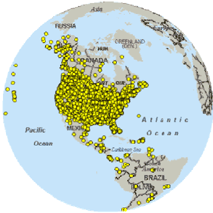
Christmas Bird Count Circles in the Western Hemisphere

The data collected by observers over the past century allow researchers, conservation biologists, and other interested individuals to study the long-term health and status of bird populations across North America. When combined with other surveys such as the Breeding Bird Survey, it provides a picture of how the continent's bird populations have changed in time and space over the past hundred years.